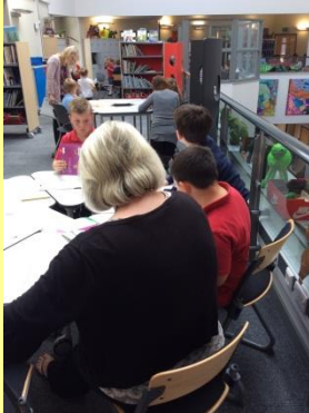
One-to-one support and small group work.

We are also very lucky to have received funding to create a sensory room which children can access if they are feeling dysregulated.